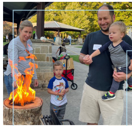
Families celebrate Sukkot at jHUB's "S'mores in the Sukkah" event.

When the COVID-19 pandemic arrived in Northeast Ohio, jHUB adapted quickly to create small Zoom get-togethers, host Facebook Live events, and deliver innovative and enriching resources including Shabbat packages and winter break