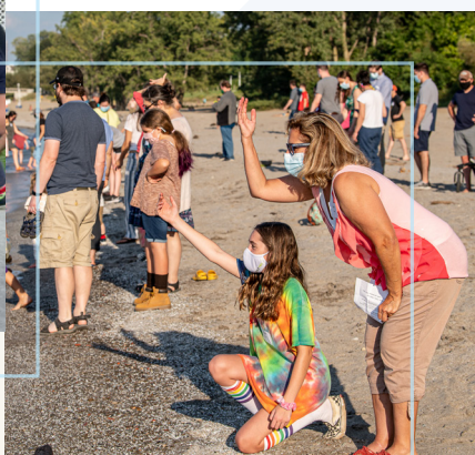
Interfaith families & couples perform Tashlich during Rosh Hashanah.

activity bags. For those who are interested, jHUB also connects individuals, couples, and families to local synagogues to ensure that they feel welcome and comfortable.